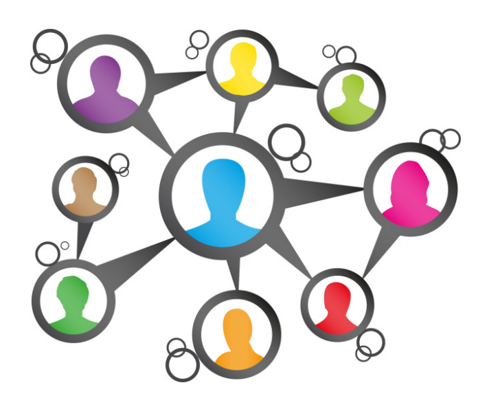
Tips for building strong work relationships

Here are some additional tips to help you foster stronger relationships with your coworkers: